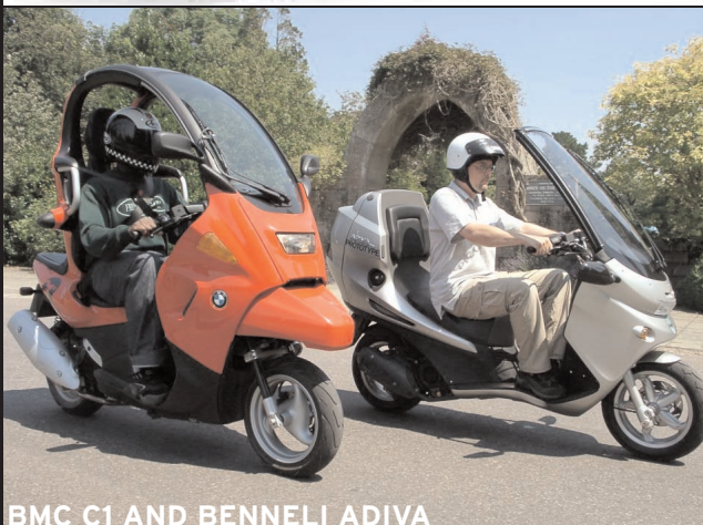
BMC C1 AND BENNELI ADIVA

Up to 24,000 early deaths per year result from poor air quality in Britain's cities and there are a similar number of hospitalisations - almost wholly as a result of vehicle emissions.